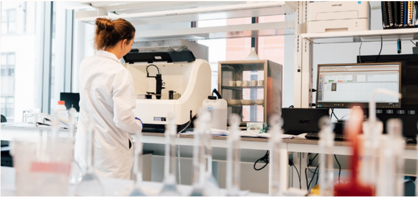
Rhode Island State Health Lab at 150 Richmond

The 195 District is the epicenter of the Rhode Island’s growing life sciences cluster. Already home to dozens of life sciences companies, the 195 District has been focused on building a life sciences sector since its inception and made tremendous progress in 2025.