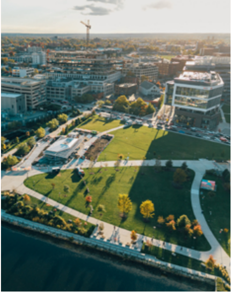
195 District Park

The 26-acre 195 District was established with the mission of transforming the reclaimed highway land into a vibrant innovation district and mixed-use neighborhood that attracts investment and drives economic growth and opportunity. Surrounded by some of Providence’s most beloved neighborhoods —Fox Point, the Jewelry District, Downtown, and College Hill—the 195 District is now emerging as a true live-work-play destination, reconnecting these communities and fueling the economic vitality of the city and state.