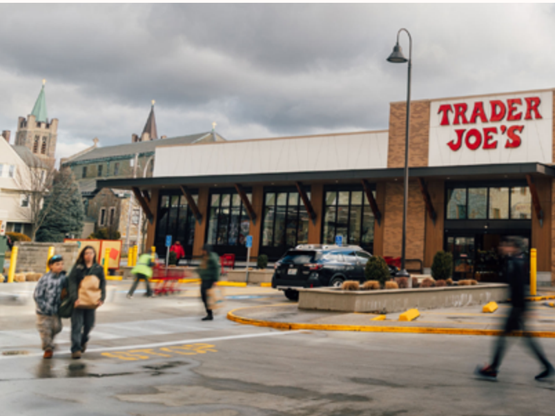
Trader Joe's / Parcel 6

The 195 District’s Ground Floor Loan Program is helping accelerate the growth of small businesses and activate the neighborhood’s street-level experience. By offering flexible, low-interest financing to lower build-out costs, the program lowers barriers for local entrepreneurs to launch ground-floor businesses. This targeted investment not only supports business success but also enhances the economic vitality of the District as it continues to grow.