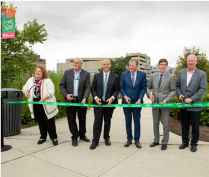
Riverwalk ribbon cutting