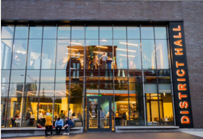
District Hall event space at Point225

Today the 195 District is a hub of activity. Point225, which was completed in 2019 and is a cornerstone of the District, the home of Cambridge Innovation Center’s (CIC’s) Providence location where more than 250 companies across 13 diverse industries employ more than 1,000 people with especially strong representation in life sciences (29 companies), energy (22 companies), and technology (27 companies).