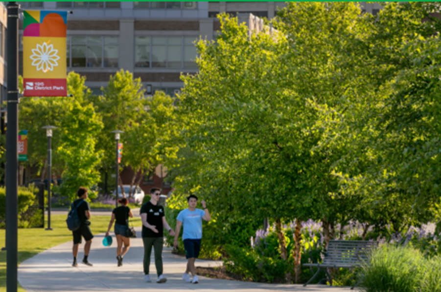
195 District Park

“195 District Park has been one of the most transformational public developments of its generation. Its next chapter will bring even greater energy to the heart of our city, welcoming neighbors, visitors, businesses, and community groups to connect and take pride in our Creative Capital.”