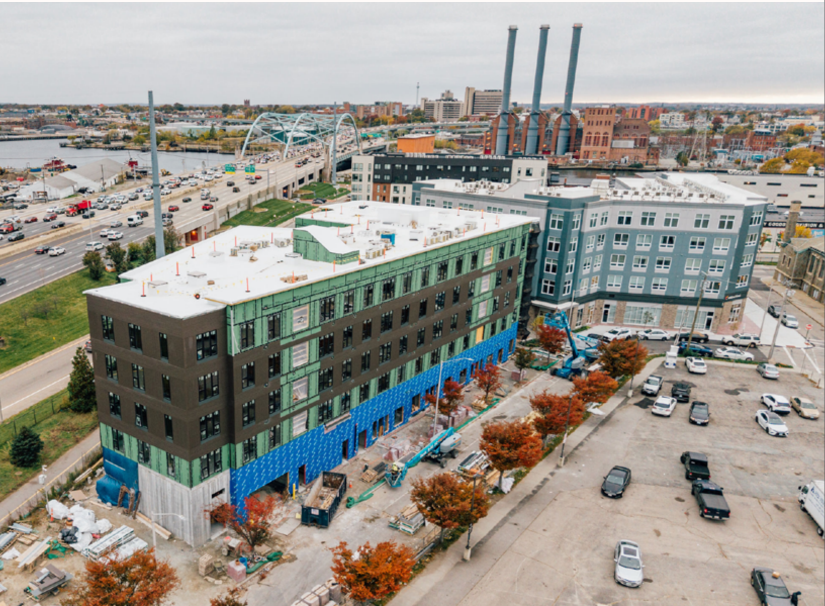
Tempo and Tandem mixed-income housing

The 195 District has aligned its work closely with the State of Rhode Island’s priorities, focusing on strategic investments in housing and infrastructure with economic growth as the objective. Investments in life science infrastructure, new mixed-income residential projects, and improved public spaces are helping to meet the state’s needs. Targeted investments—including the District’s innovative ground-floor loan program—are helping small businesses launch and thrive, creating a diverse ecosystem of local shops and services.