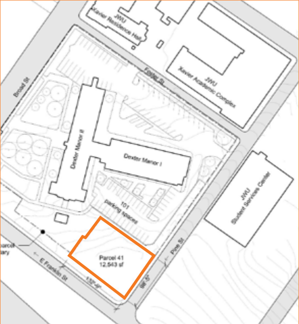
Dexter Manor and Parcel 41