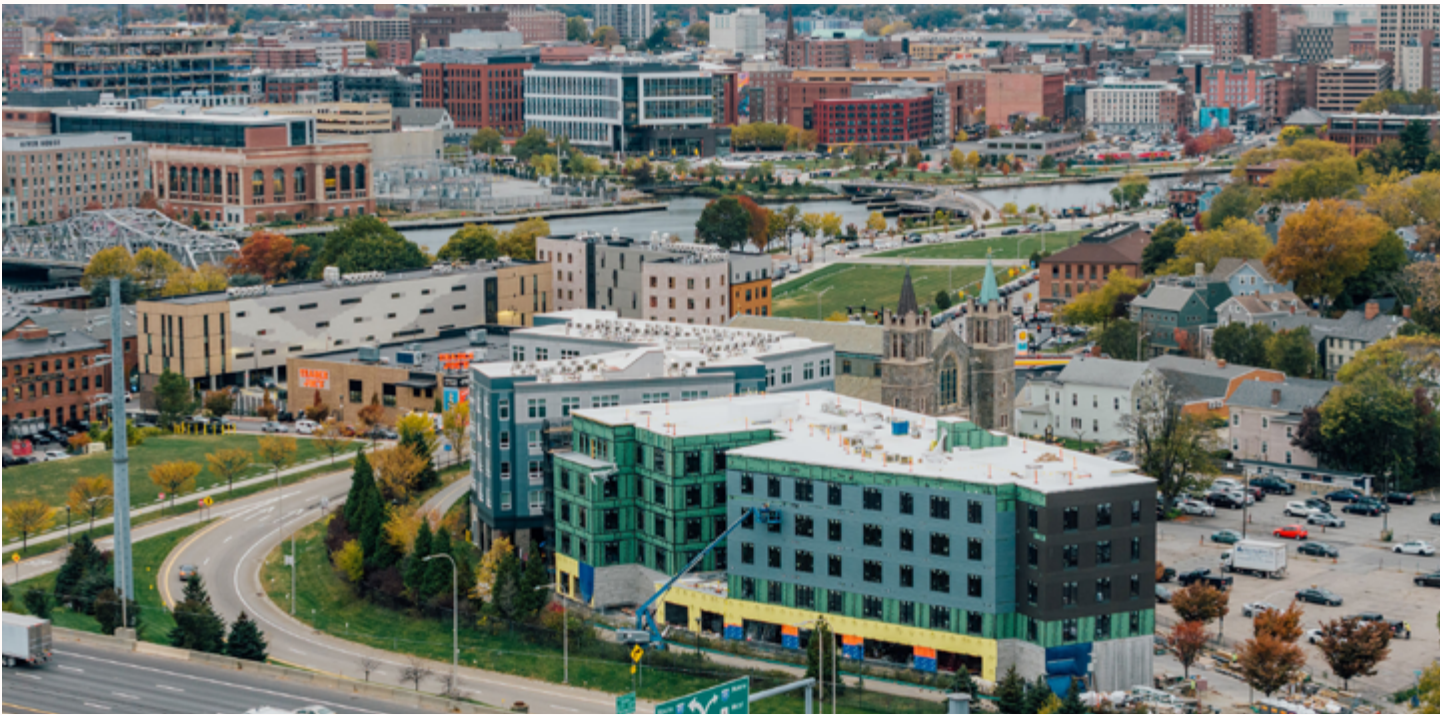
Tempo and Tandem

The 195 District has become one of Providence’s most sought-after destination neighborhoods, offering the mix of amenities and liveliness that draw people to live, work, and explore. With new housing units, the vibrancy of 195 District Park, Trader Joe’s, and an expanding network of ground-floor retail, the District is becoming a true hub of daily activity. Together, these elements not only enhance quality of life but also fuel significant economic development, driving job creation, attracting private investment, and encouraging sustained growth.