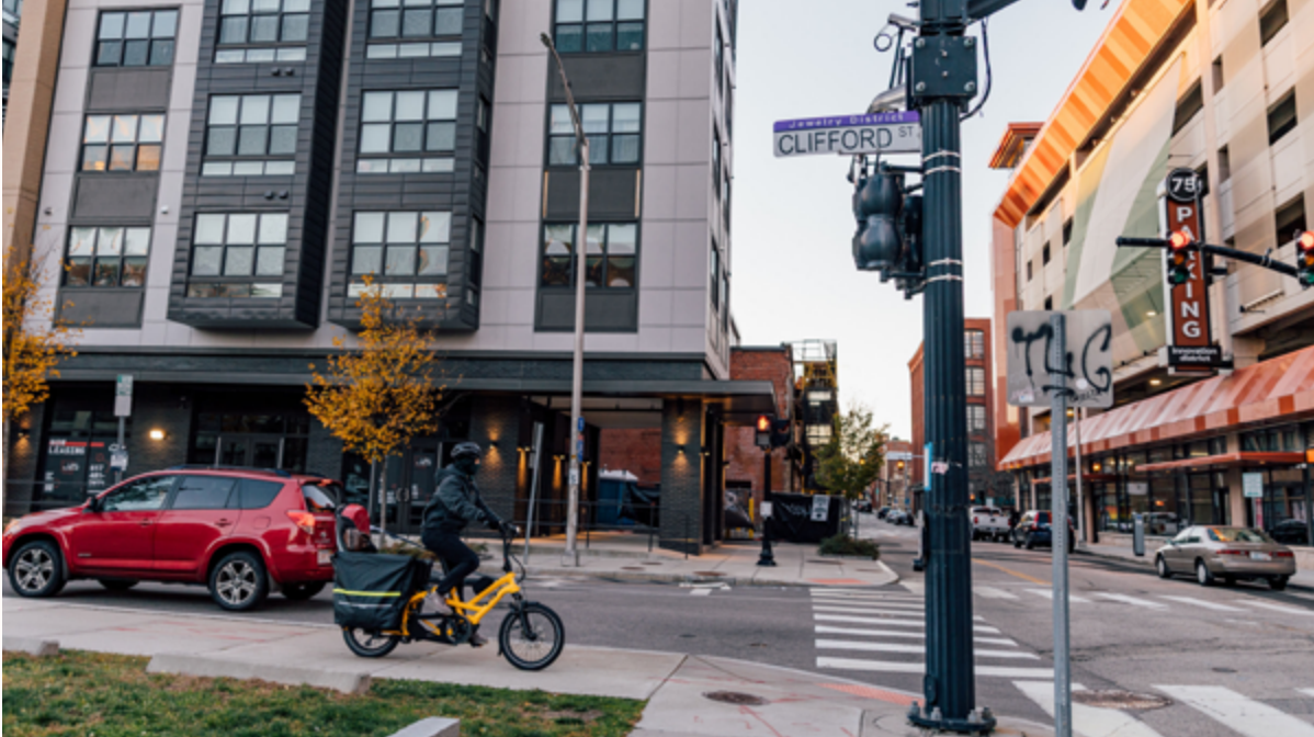
Emblem 125 and Innovation District Garage