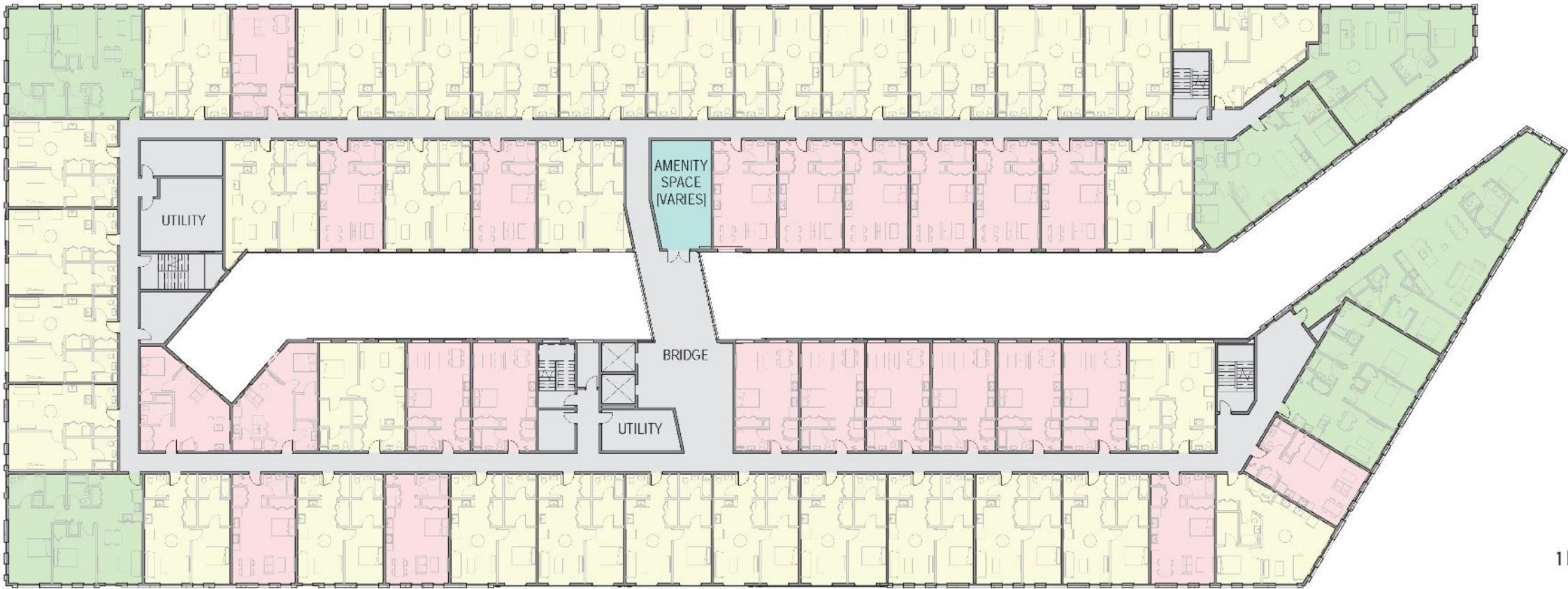
Typical Upper Floor Residential Units Mix of Studio, 1-BR & 2BR