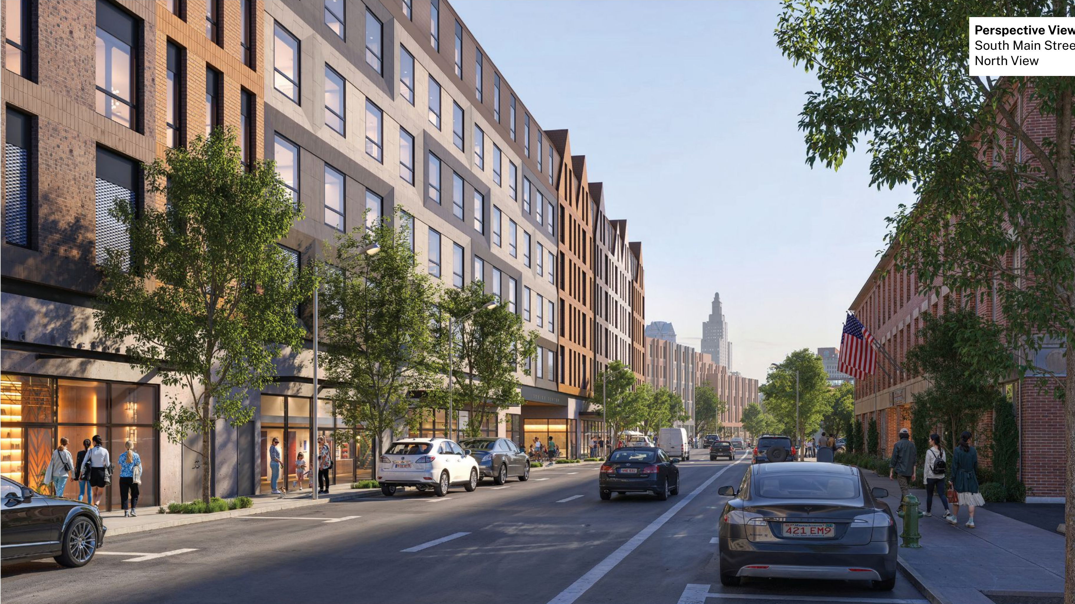
Perspective View: South Main Street North View