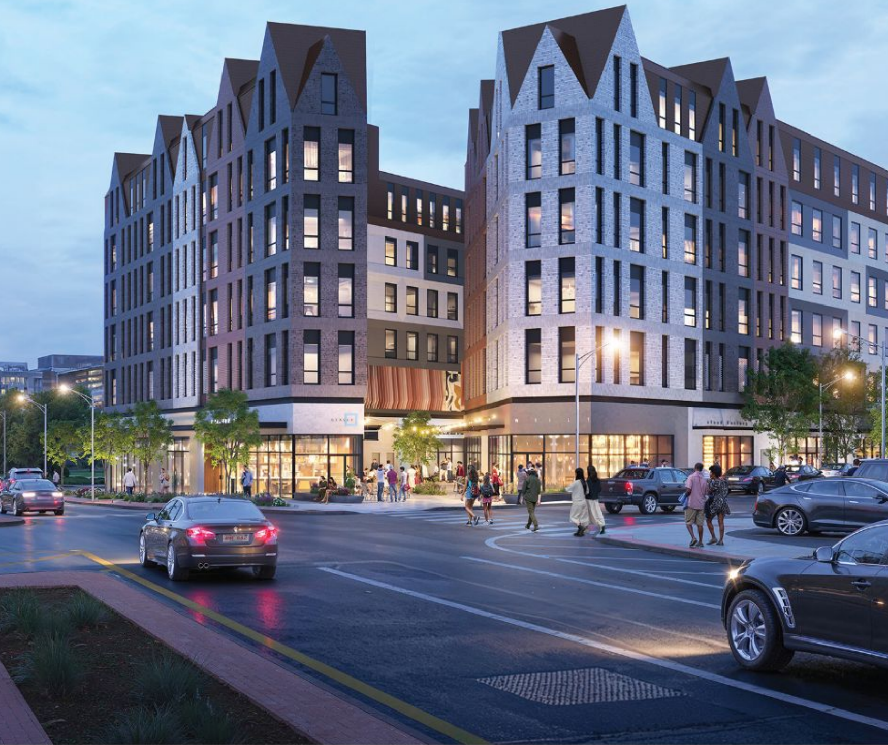
Perspective View: Wickenden Street West View